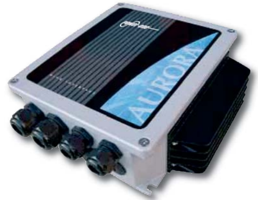
Wind Interface Box

The model PVI-Windbox is used in combination with the Aurora Wind Inverter.